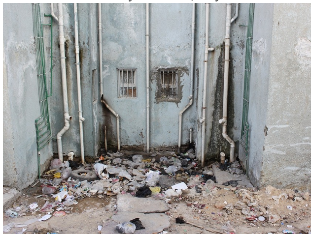
Signs of neglect and garbage accumulation Photo taken by the author, May 2016