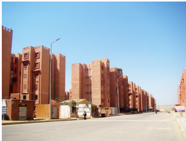
Physical adaptation by the residents to create commercial slots in the area Photo taken by the author, May 2016

Two field visits were conducted to Osman Buildings. The observations of the site were as follows. Upon arrival at the place, one can notice the very similar six-storey buildings that differ only in the façade color, in addition to few scattered shops and cafes. Every group of buildings is very close to one another and separated by pathways and large space areas. Such large spaces that should be safe playground places for children in fact turned to be full of sewage water and garbage. One can also see that residents used other areas for raising chicken. Besides children hang around and play between piles of garbage and stray dogs without any control. One can easily get a sense of insecurity due to the emptiness of the surrounding areas and the absence of distinctive characteristics of the place.